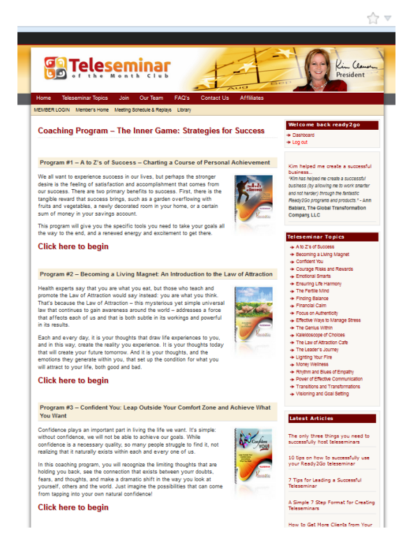
Finding Balance: Reclaim Your Time and Live a More Fulfilling Life Self-Study Coaching Program Preview